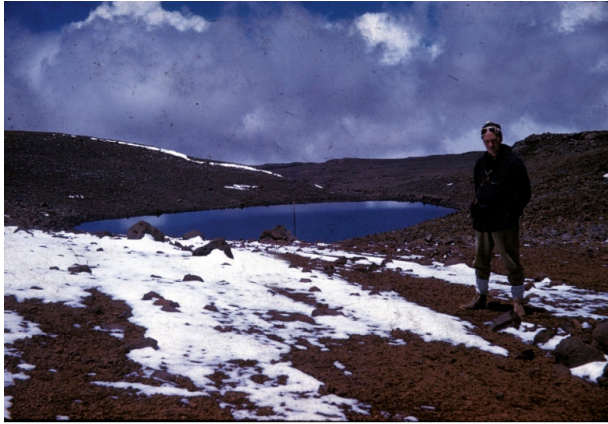
Small lake at 12,500' on Mauna Kea in Hawaii. 1958

Shhhhtttthhhleep! That's the sound of air rushing into a round bowling ball sized flask being held up to the wind by a scientist in 1958. The air was an oncoming oceanic breeze whooshing by a tall mountain in Hawaii called Mauna Loa. Once the whooshing air was inside the flask, the scientists sent the air sample to an analyzer to figure out the carbon dioxide ( \text{CO}_2 ) concentration in the air. Measurements of \text{CO}_2 concentration on Mauna Loa are now made every ten minutes (now this is done with an automatic gas analyzer, instead of someone holding up a flask millions of times). This record of data from Mauna Loa, which began in 1958,